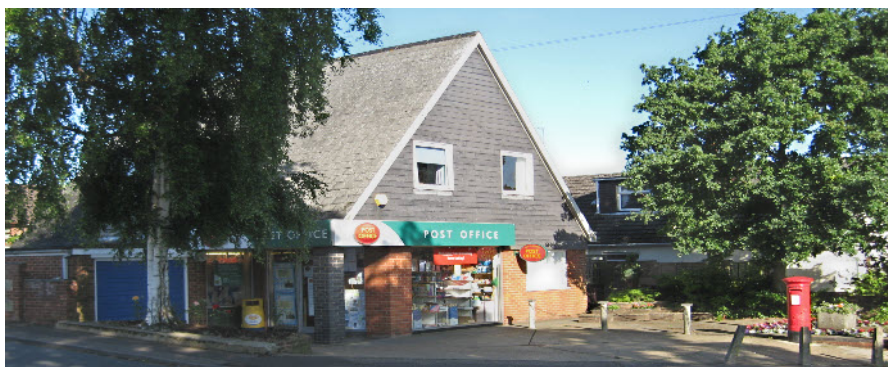
New Costessey Post Office - under threat?