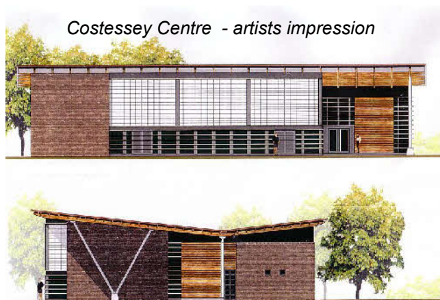
Costessey Centre - artists impression

If all goes as planned, the Costessey Centre could open by Spring 2010.